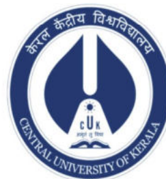
Central University of Kerala

PANDIT MADAN MOHAN MALVIYA NATIONAL MISSION ON TEACHERS AND TEACHING (PMMMNMTT)