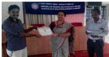
NSS Programme Officer Orientation at Rajagiri Institute of Social Science, Kalamasserry.