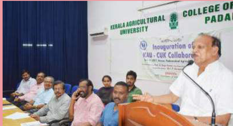
Shri. P. Karunakaram, the Member of Parliament inaugurates PARASPARAM Programme

The inauguration of the Collaborative ventures of NSS activities of Central University of Kerala NSS Cell with the NSS Units of Kerala Agricultural University (named PARASPARAM) was held on 1.11.2017 at Kerala Agricultural College at Padannakkad.