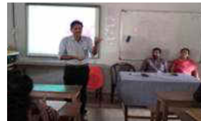
Received ICSSR Major Research Project in Education.