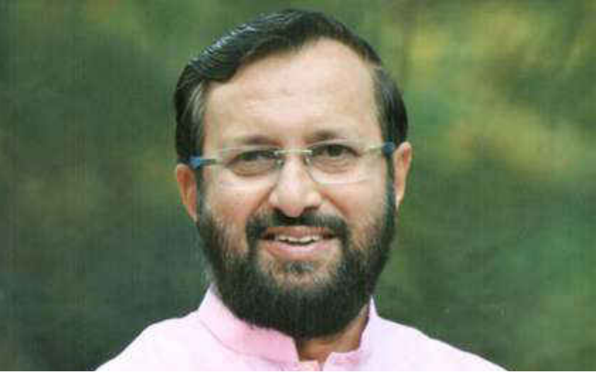
Shri. Prakash Javadekar