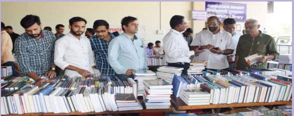
Faculty members, Staff and Students in the Book Fair