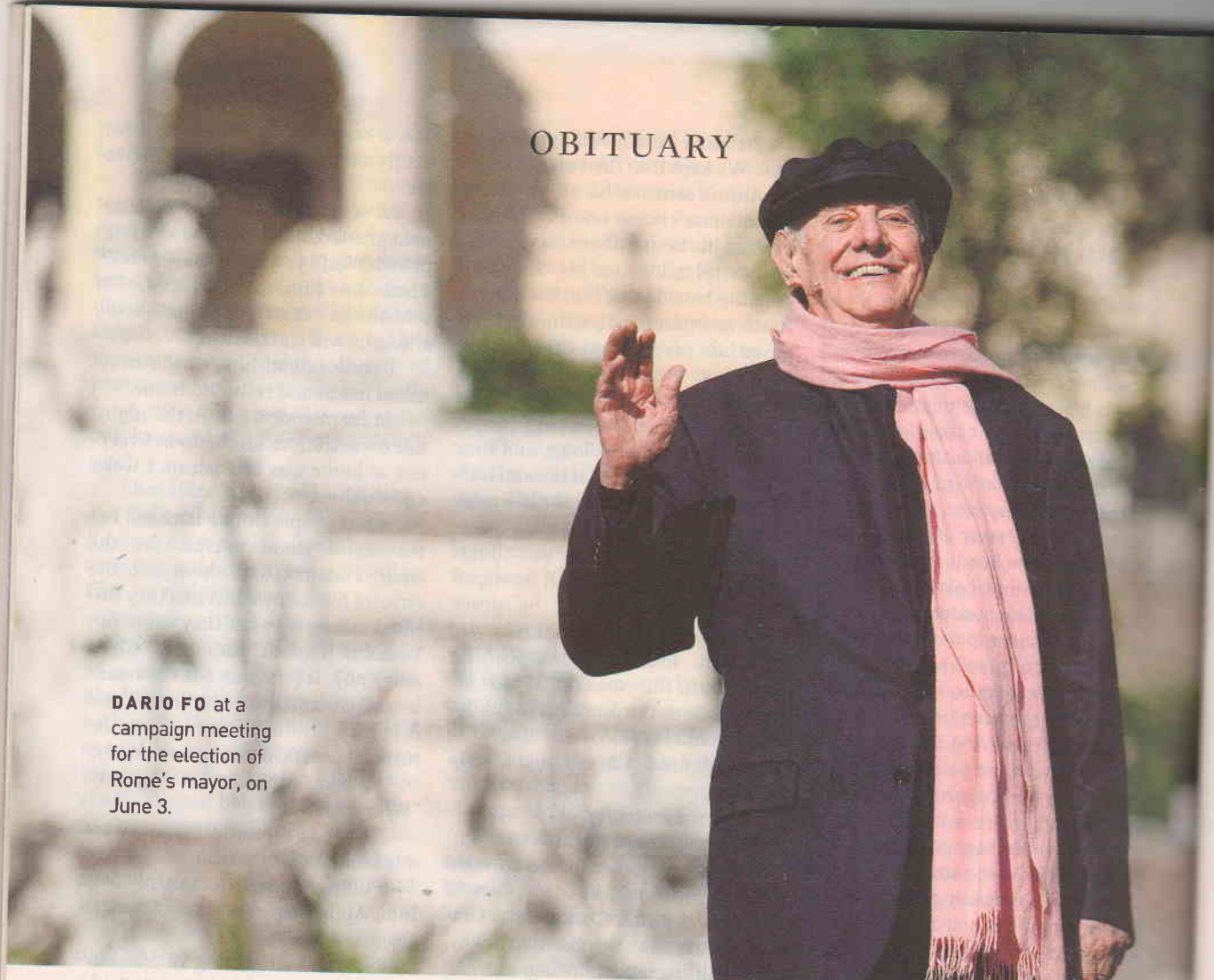
DARIO FO at a campaign meeting for the election of Rome's mayor, on June 3.