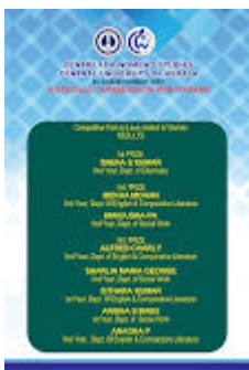
Winners - NCW Competition.JPG 2087K