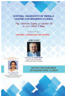
Prize Distribution Ceremony.JPG 570K