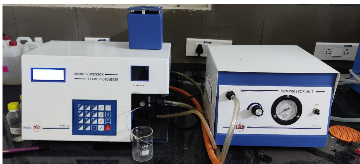
Fig. 2.3. Microprocessor Flame Photometer (ESICO, MODEL 1382)

The concentration of potassium in groundwater sample was estimated using the flame photometer. Microprocessor Flame Photometer (ESICO, MODEL 1382) was used for this purpose (Fig. 2.3). The flame photometer was calibrated using standard samples of sodium, potassium and calcium. The flame photometer works on the principle that each metal emits a characteristic light intensity when it is introduced to the flame. The wavelength of colour and its intensity varies with respect to characteristic metals. The presence of sodium imparts a yellow colour to the flame while orange and lilac colours indicate calcium and potassium respectively. The concentration of each cation is displayed when the sample is introduced to the flame photometer through nebuliser.