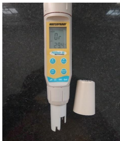
Fig. 2.2. Multi- Parameter PCSTestr 35 (EUTECH).