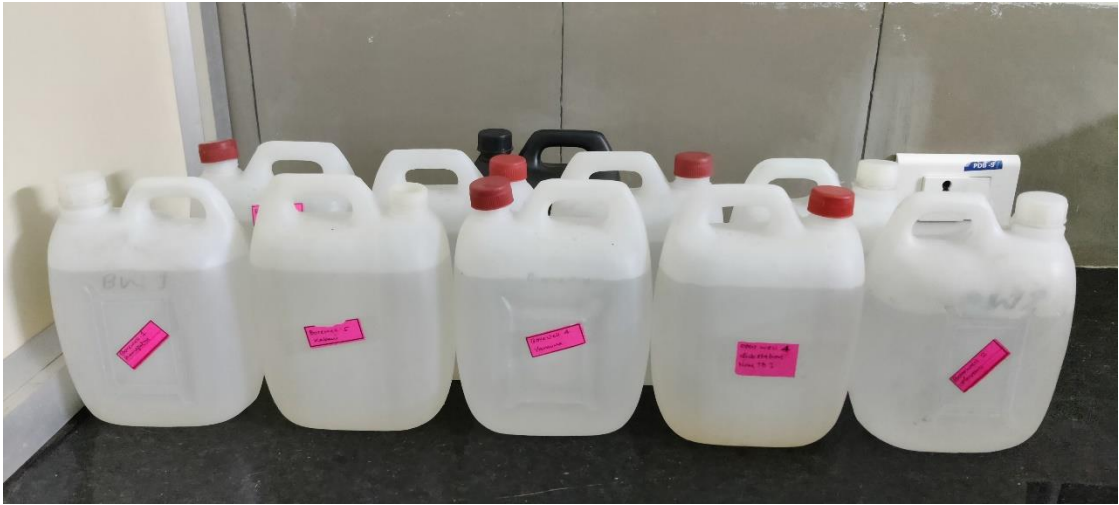
Fig. 2.1. Water samples in one litre plastic cans.

The ground water samples from 6 borewells and 4 open wells were collected to assess the water quality. The water samples were collected in 1 litre plastic cans (Fig. 2.1). The bottles were cleaned and rinsed with water thoroughly prior to collection. The water samples were transported to laboratory immediately for analysis.