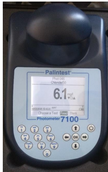
Fig. 2.4. Palintest Photometer 7100

Palintest Photometer 7100 was used to estimate the concentration of cations like magnesium, iron and anions like chloride, sulphate and fluoride (Fig. 2.4). It works on the principles of optical absorbance and scattering of visible light. The Palintest photometric reagents create visible colours with specific analytes and intensity of colour produced is measured using the photometer and the data is compared with the calibrated data already stored in the device producing the results.