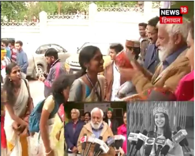
एक भारत-श्रेष्ठ भारत कार्यक्रम, केरल के छात्र पहुंचे धर्मशाला